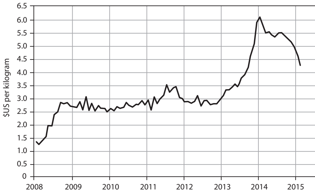
Figure 1 Price of quinoa, $US per kilogram