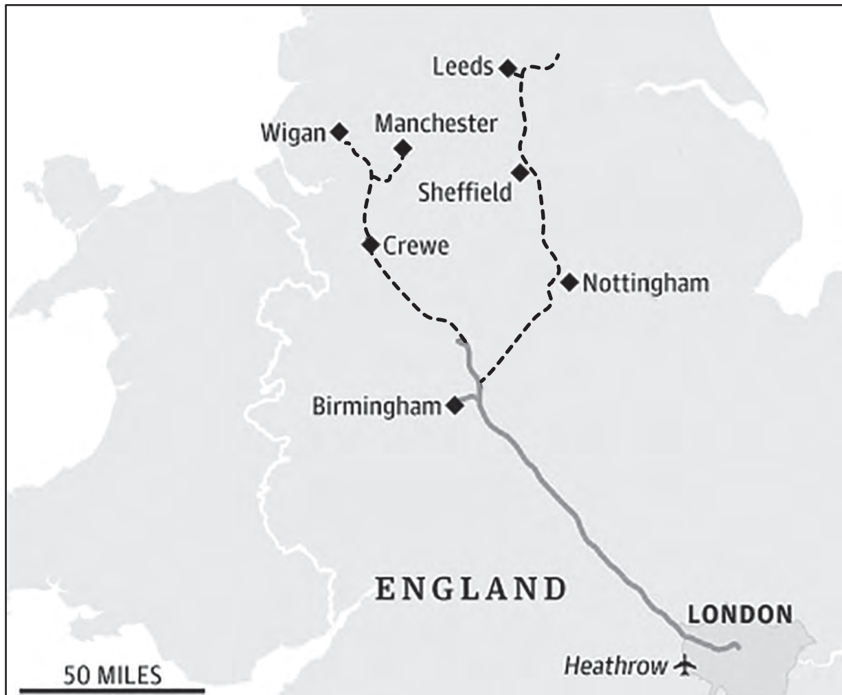
Figure 1 The HS2 route in England, UK